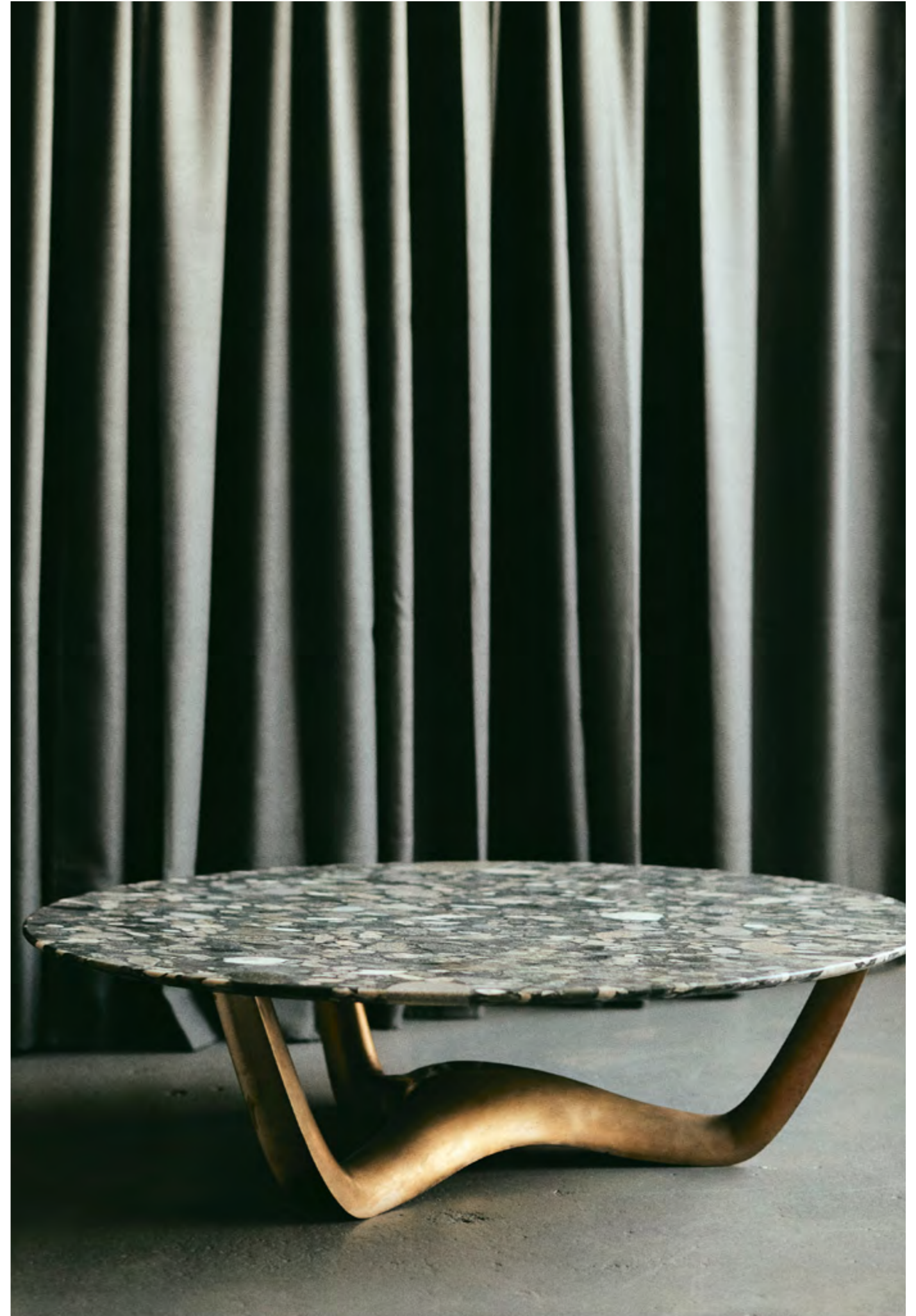
WISH coffee table 1200 satin with Nero Marinace granite